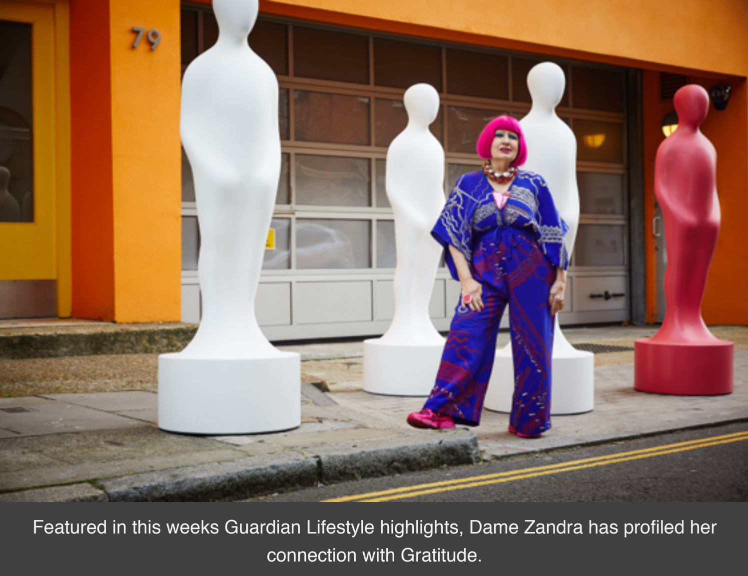
Featured in this weeks Guardian Lifestyle highlights, Dame Zandra has profiled her connection with Gratitude.

In December, we announced that Dame Zandra Rhodes joined Gratitude as our Creative Ambassador. Part of her role will be to support our design shortlisting process; casting her eyes over the myriad of submissions, as well as attracting engagement with more established and profiled artists & designers from across her networks.